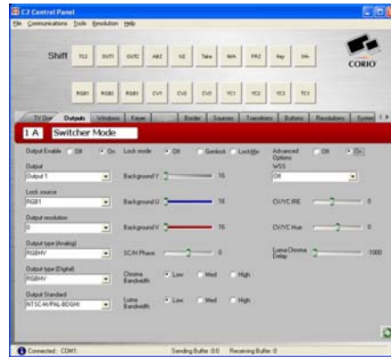
Windows Setup Menu