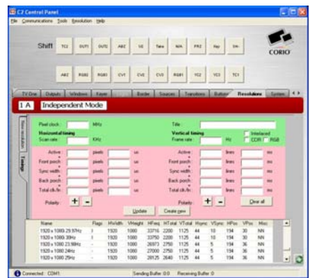
Resolution Editor Menu