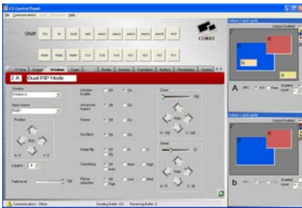
Switcher Dual PIP Menu