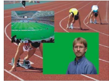
Multi-Format, Dual PIP over an Active Video Background