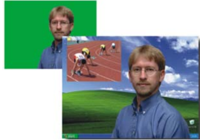
Dual Channel Chromakey with simultaneous PIP Insertion